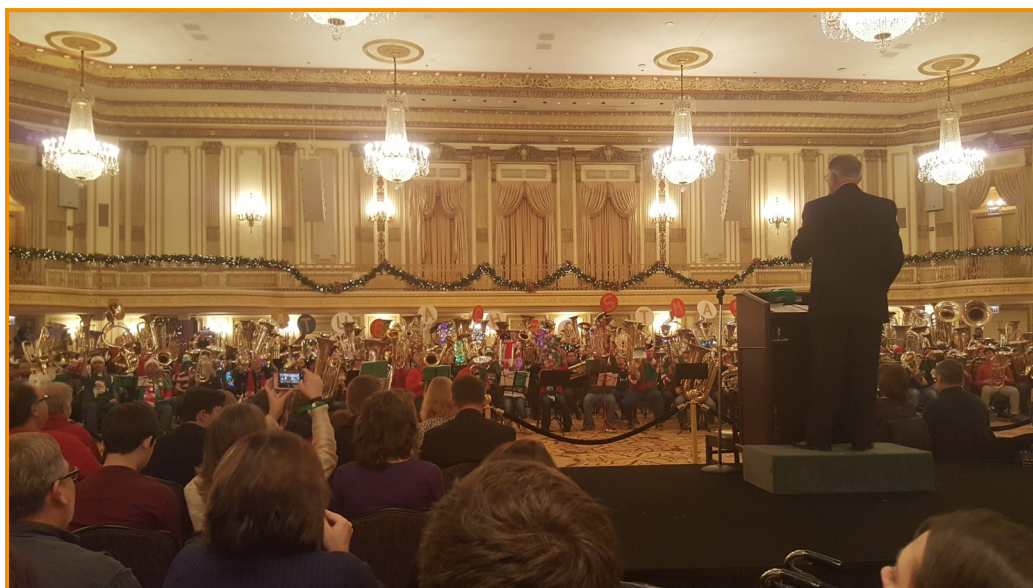
Tuba Christmas 2017 will be held at the Palmer House Chicago on Saturday, December 23rd at 12:30 p.m. Several SHS students will perform in this spectacular holiday concert event.